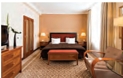
Kempinski Grand Hotel des Bains Guestroom

d'Oro,' awarded an impressive 15 Gault Millau points, specialises in innovative variations on traditional Italian dishes. Its combination of traditional sophistication, superior service, contemporary furnishings, and vibrant modern paintings creates an ambience which is both comfortable and stylish. The guestrooms are modern and welcoming, using the warm tones of cherry wood and a soft colour palette to soothe and contrast with the brilliance of the natural landscape outside. For the ultimate indulgent experience there are two opulent suites; located in the towers of the hotel, they are flawlessly appointed in refined colour schemes of golden tones, rich reds, and champagnes befitting royalty. The Kempinski Grand Hotel des Bains offers the discerning guest a luxurious pampering experience in an idyllic location throughout the year.