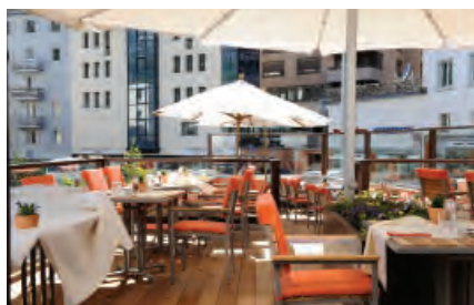
Hotel Schweizerhof St Moritz terrace