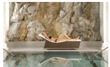
Kempinski Grand Hotel des Bains spa