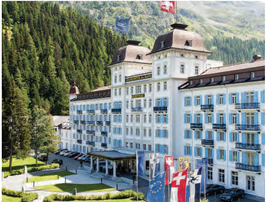
Kempinski Grand Hotel des Bains

d'Oro,' awarded an impressive 15 Gault Millau points, specialises in innovative variations on traditional Italian dishes. Its combination of traditional sophistication, superior service, contemporary furnishings, and vibrant modern paintings creates an ambience which is both comfortable and stylish. The guestrooms are modern and welcoming, using the warm tones of cherry wood and a soft colour palette to soothe and contrast with the brilliance of the natural landscape outside. For the ultimate indulgent experience there are two opulent suites; located in the towers of the hotel, they are flawlessly appointed in refined colour schemes of golden tones, rich reds, and champagnes befitting royalty. The Kempinski Grand Hotel des Bains offers the discerning guest a luxurious pampering experience in an idyllic location throughout the year.