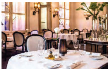
Kempinski Grand Hotel des Bains dining