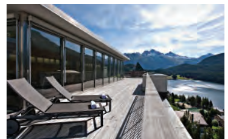
Hotel Schweizerhof St Moritz spa terrace