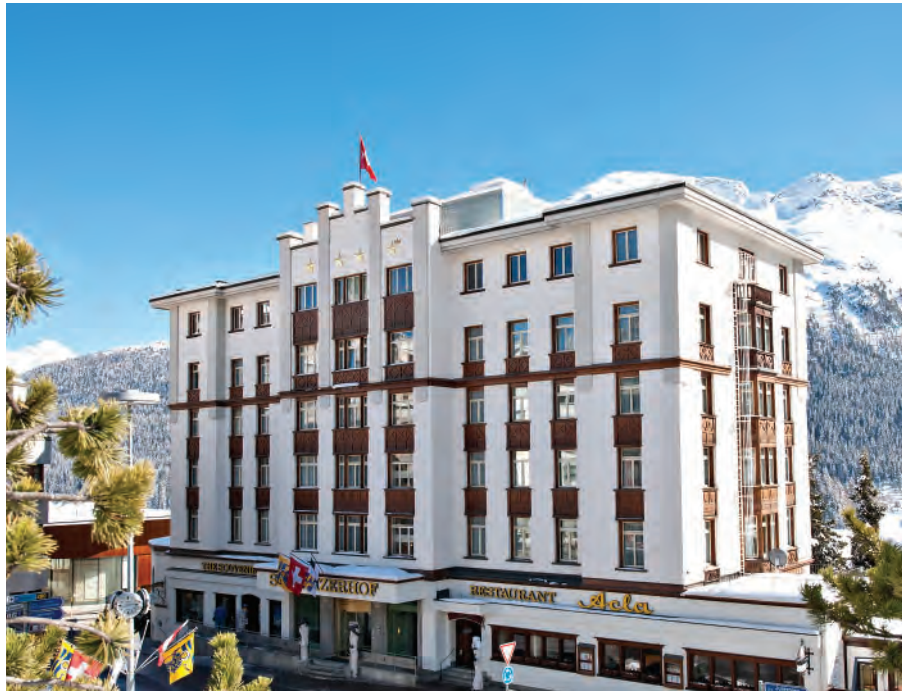
Hotel Schweizerhof St Moritz