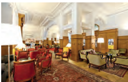
Hotel Schweizerhof St Moritz lobby