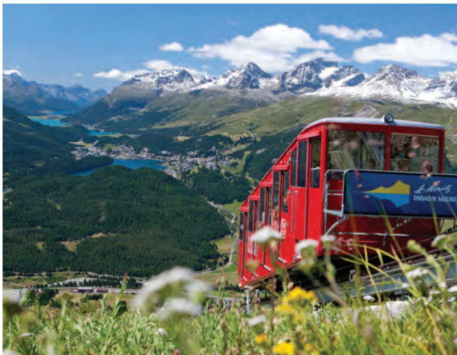
View over St Moritz

We recommend travelling to Switzerland by train from London to St Moritz, via Paris, Zurich, and Chur. Return flights from the UK with rail travel in Switzerland can also be arranged. Your destination is St Moritz, in the shadow of the Suvretta Mountain and on the shores of the startlingly beautiful Lake St Moritz. Use your time here to explore the surrounding mountain peaks on foot or by funicular, rack railway, or cable car, taking in the views across the Engadine Valleys, the castles perched on high rocks, and the small villages almost completely hidden by forested mountain slopes. St Moritz itself has always been a particularly popular Swiss winter destination, but its value extends into the summer months, as the snow thaws to reveal a network of hiking trails and transforms the town itself into a chic collection of boutique shops and cafes, and gourmet restaurants. One of the highlights of your stay here will be the fantastic rail journeys that sit just on your doorstep, be it the local services that meander through the valleys or the grand Bernina Express, one of the most iconic rail journeys in Europe.